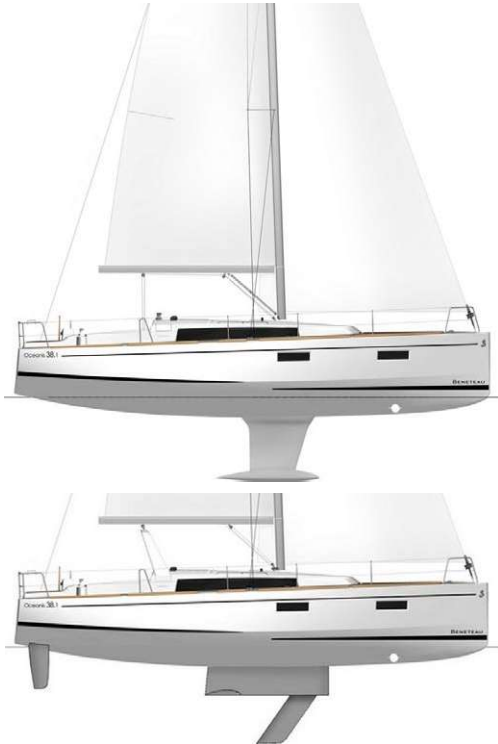
Sailing dinghy - Option: Arch